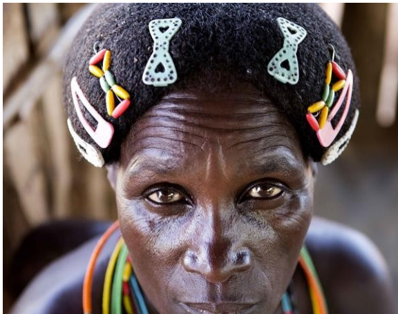
pic. 3 (RTang)