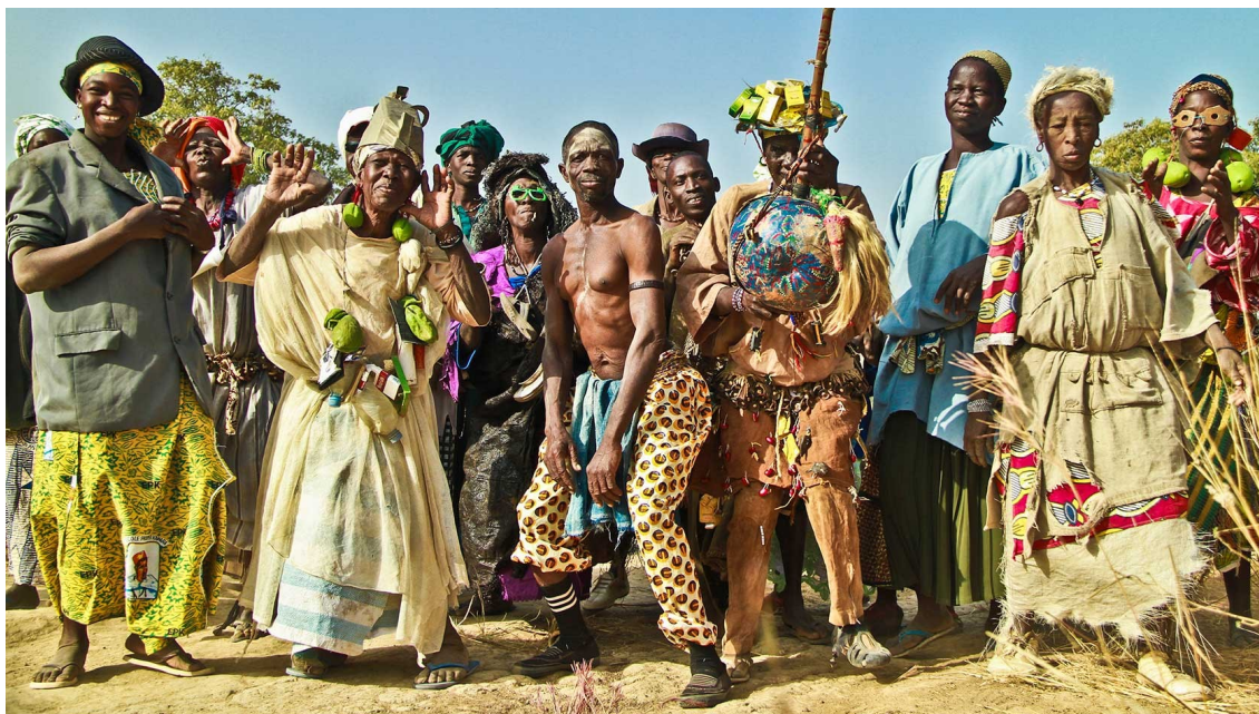
Pic. 14.

completely. Therefore, counter-strategies can be effective in a humble sense. Yet, all of them bestow benefits in challenging colonial binary representations.