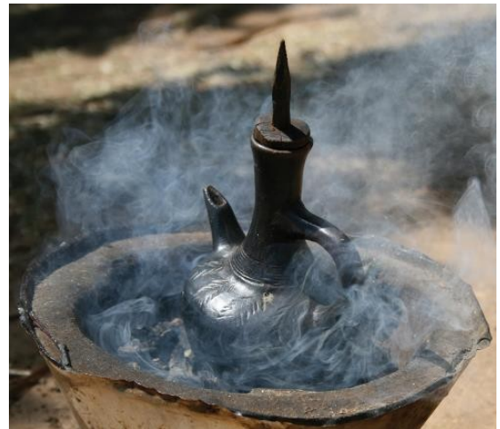
pic. 9 (WE)