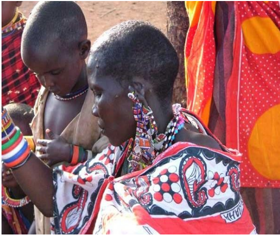
pic. 5 (RTken)