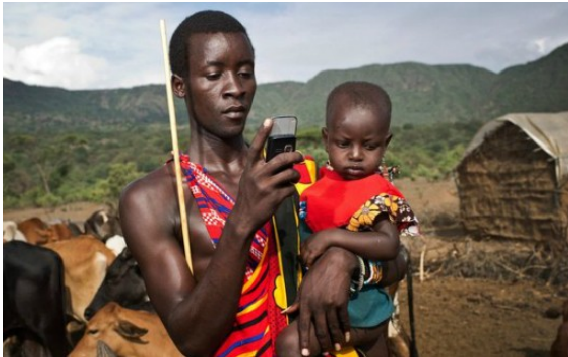
Masai with Mobile phone checking latest market produce prices.