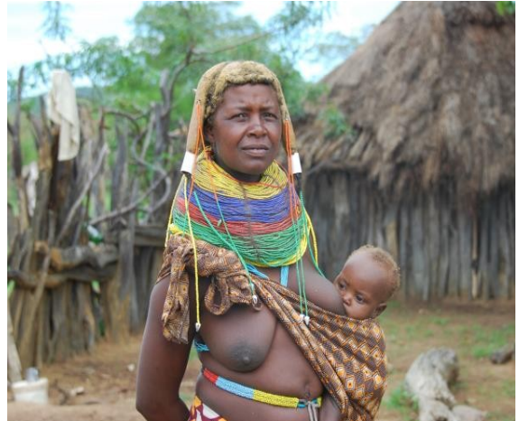
pic. 2 (RTang)