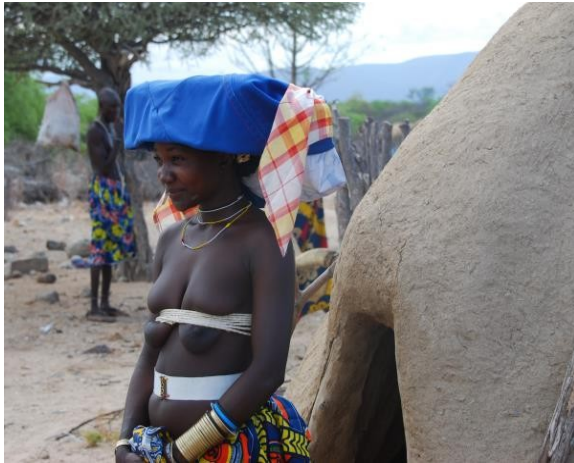
pic. 1 (RTang)