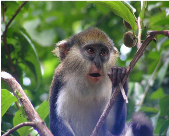
pic. 10 (IT)