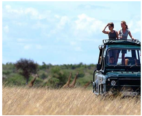
pic. 6 (RTken)