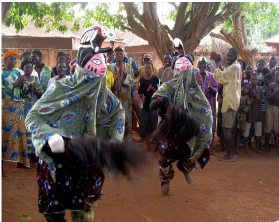
pic. 12 (IT)