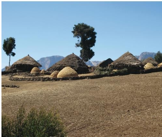
pic. 8 (WE)