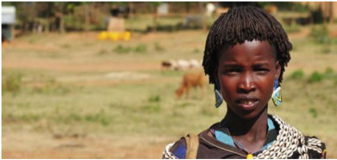
pic. 7 (WE)