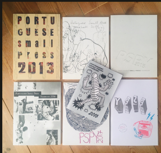
Figure 1.2 Portuguese Small Press Yearbook covers 2013-2019.

For the above reasons, punk publications, by their very nature, have a place in the project. They are affordable and democratic multiples, produced in the context of contemporary art. Typically they are fanzines, magazines, brochures, posters, postcards, newspapers, self-published or published by small presses. Some can be also classified as artist's books. And because they are being published since the 1970s, they qualify to integrate both the database and the Yearbook.