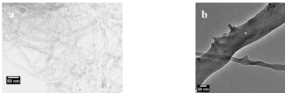
Figure 3: TEM micrographs of a) CNTs b) PEO electrospun fibres containing CNT's

The colouration of the fibre mat and the TEM micrographs show that high loadings of CNT's within nanofibers are possible. There is a visible number of tubes along the fibre axis (Figure 3b) which shows the potential for good connectivity of CNT's in the nanofibers leading to a higher level of conductivity. This was accomplished without need to modify the nanotubes prior to mixing to make them more dispersible in an aqueous media and high levels of loading were achieved, reducing dripping and promoting spinning by the addition of a surfactant.