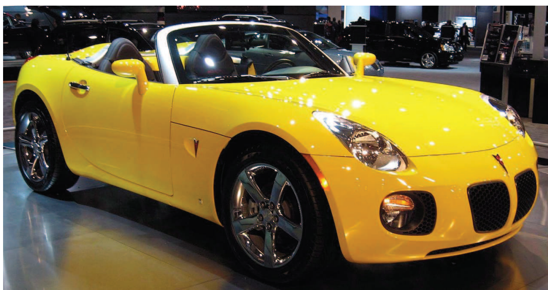
PONTIAC DEBUTS 2007 SOLSTICE GXP AT LA AUTO SHOW The GXP version of the Solstice debuted at the Los Angeles Auto Show in January 2006.

The Pontiac Solstice Coupes are considered to be quite rare: There were a total of 1,266 Solstice Coupes that were able to be manufactured before the production line in Wilmington, Delaware was shut down: 102 pre-production 2009 models, 1,152 sequentially-vin'd regular production 2009 models, and 12 pre-production 2010 models. This is in contrast to over 64,000 of the Pontiac Solstice Convertibles that were manufactured.