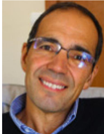
Paulo Sérgio Duque de Brito Polytechnic of Portalegre, Portugal