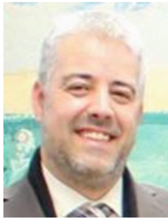
Henrique Almeida Leiria Polytechnic