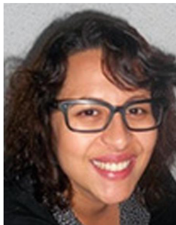
Catarina Nobre Portalegre Polytechnic