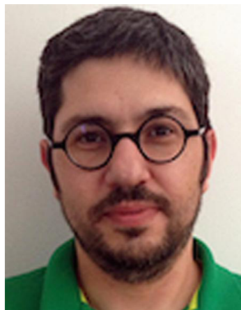
Pedro Monteiro Portalegre Polytechnic