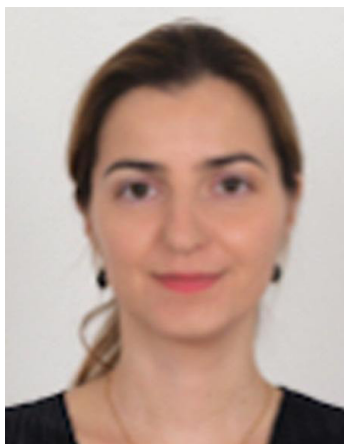
Vânia Ribeiro Leiria Polytechnic