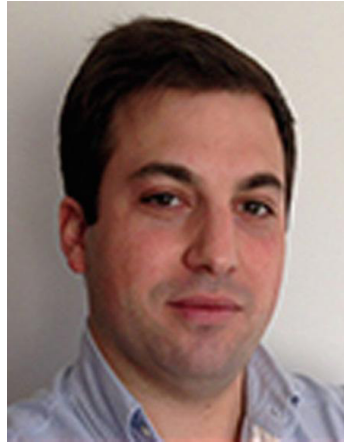
Flávio Craveiro Leiria Polytechnic