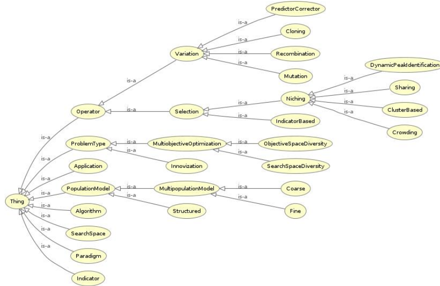
Fig. 3. Diversity Oriented Optimization Taxonomy.

and the environmental selection phases of evolutionary algorithms, and the latter can even be combined with preserving solutions in the archive as in the Portfolio Optimization Selection Evolutionary Algorithm (POSEA) [44]. Testing the approach on some benchmarks shows its efficiency when compared to the state-of-the-art indicator-based evolutionary algorithms and its potential for many objective optimization application due to the fact that its complexity is independent of the number of objectives.