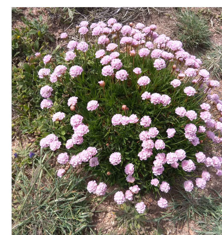
Figure 3. A. berlenguensis