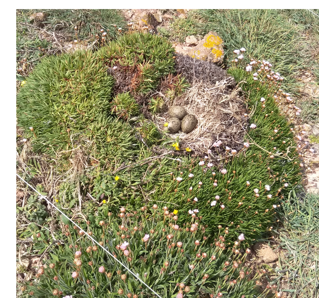
Figure 4. seagull nest on a large specimen of A. berlenguensis

Surveys were performed every three months, from may 2015 to may 2018: