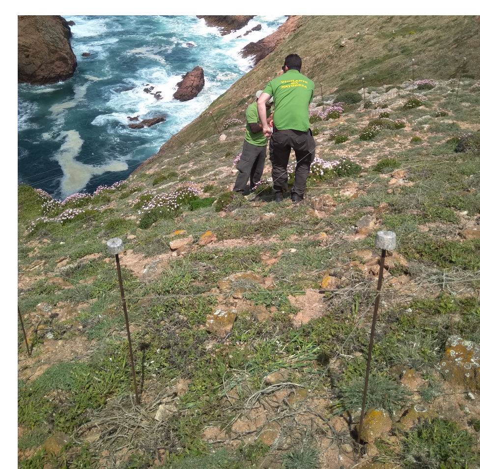
Figure 2. Exclusion zone with A. berlenguensis