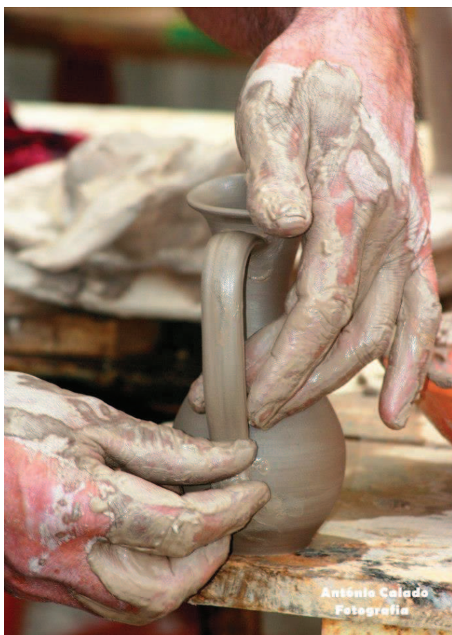
António Calado Fotografia

These shorts lower the resistance of the palladium layer. Researchers have used nanoparticles called nanotrapods studded with nanoparticles of carbon to develop low cost electrodes for fuel cells. This electrode may be able to replace the expensive platinum needed for fuel cell catalysts. A catalyst using platinum-cobalt nanoparticles is being developed for fuel cells that produce twelve times more catalytic activity than pure platinum. In order to achieve this performance, researchers anneal nanoparticles to form them into a crystalline lattice, reducing the spacing between platinum atoms on the surface and increasing their reactivity.