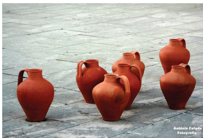
António Calado Fotografia

Magnetic nanoparticles have tendency to Increase density storage media many folds. Hydrogen storage applications using metal Nano-clusters, Renewable energy, Catalysts for combustion engines to improve efficiency, hence economy are few more examples.